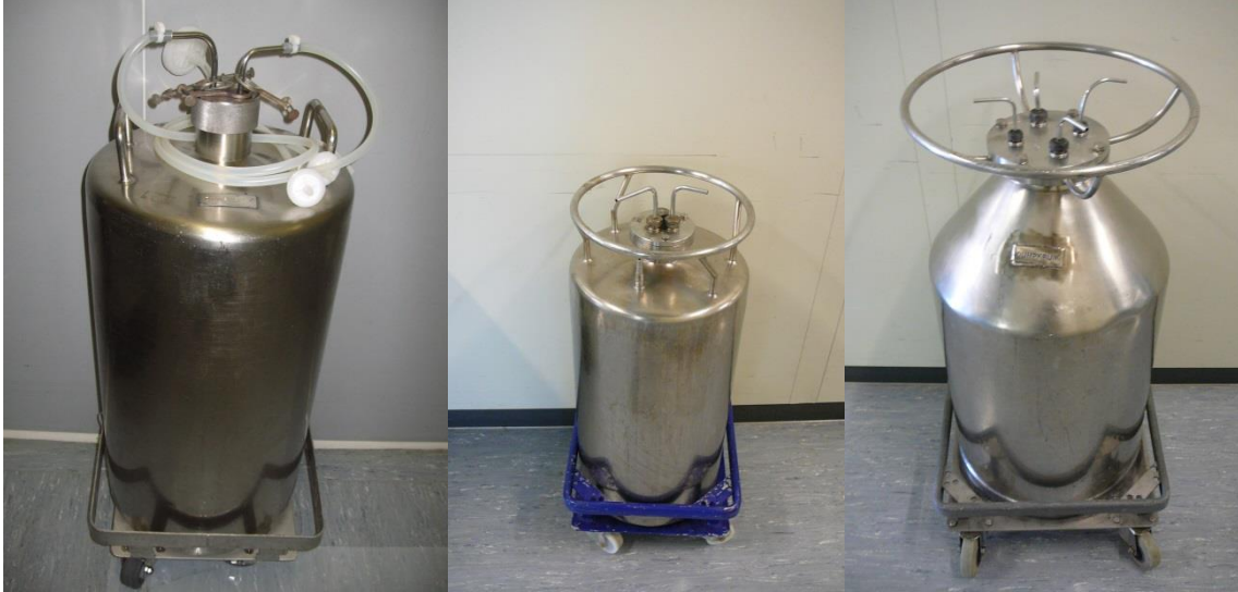
90 L version