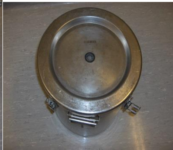
Top of stainless-steel container