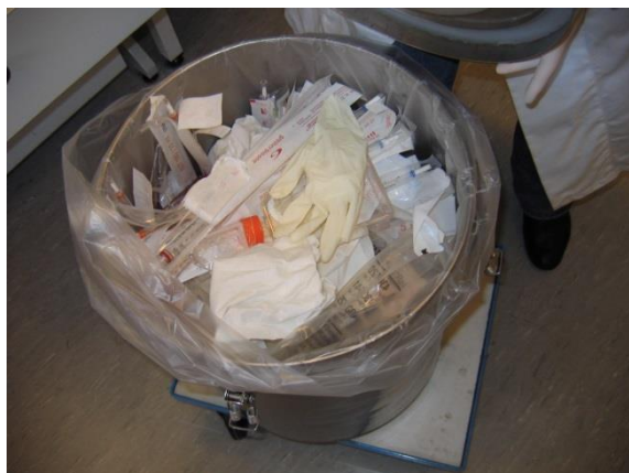
Stainless-steel container with shrink bag and non-homogeneous content

The autoclave operator takes over the stainless-steel waste container, places it in the autoclave and starts the destruction process. Upon delivery the stainless-steel waste container is immediately assessed and measures are taken immediately in the event of defects and/or the BSO is engaged for advice. There is no intermediate storage for this waste category at the autoclave.