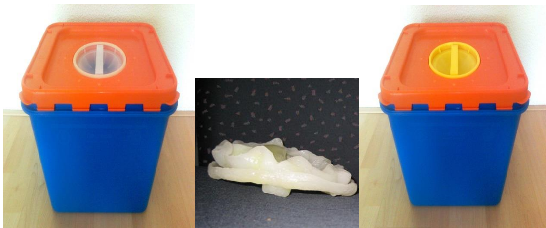
Orange Snap-on lid + Ldpe centre lid

The WIVA container with custom orange lid and melt cap (Sterilid) can, following successful validation of the load in the autoclave/destructor, be used to remove disposable waste from laboratories with containment level 3 /containment level ML-III. As such this will not need to be re-loaded following autoclaving/destruction and can be disposed of as autoclaved hospital waste to the incinerator.