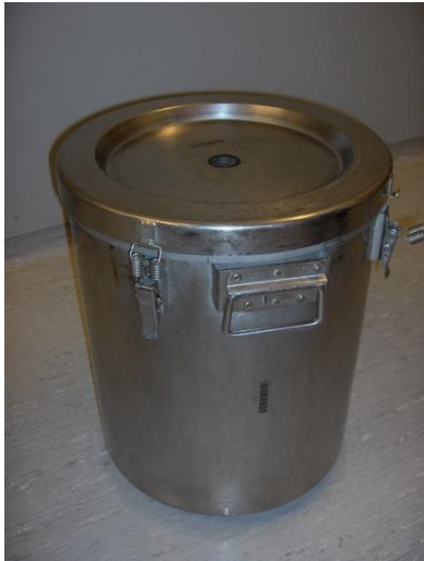
Stainless-steel container with barcode on lid and container