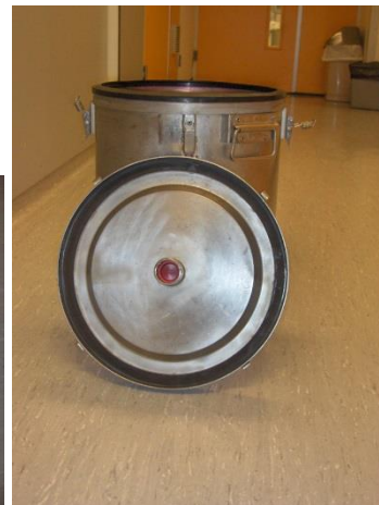
Lid stainless-steel container underside (silicone rubber rim and red pop-up cap)

Stainless-steel containers are metal containers with a capacity of 40 litres. The stainless-steel container weighs approximately 11 kg when empty. The lid is clamped to the container with four clamps. Once the clamps have been folded back, use the special tools to open the container, available from the PSP Logistic centre. Do not use a screwdriver as this could damage the edge and render the container unusable! The silicone rubber rim ensures optimal closure during transport. The stainless-steel container is suitable for transporting waste with BA up to an including category 3 (including polio and vaccinia) and GMOs up to and including containment level III, to the autoclave/destroyer. For category 3 waste (including polio and vaccinia and GMOs with containment level III), the autoclave must be located in the building.