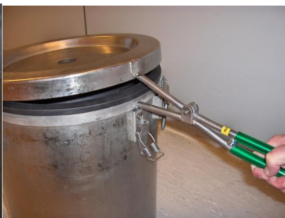
Special tool for opening stainless-steel container