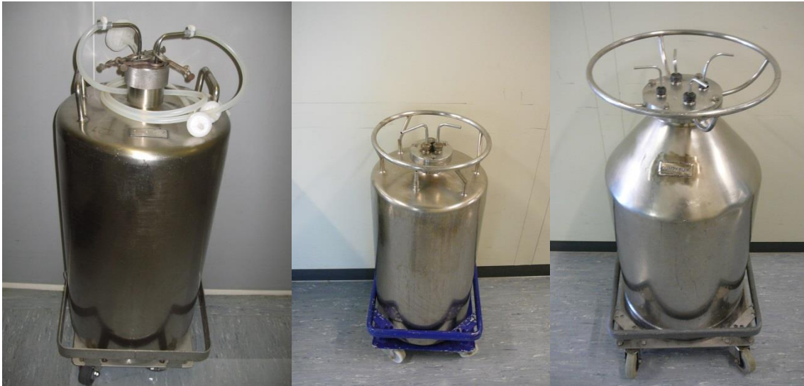
90 L version