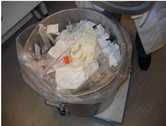
Stainless-steel container with shrink bag and non-homogeneous content

The autoclave operator takes over the stainless-steel waste container, places it in the autoclave and starts the destruction process. Upon delivery the stainless-steel waste container is immediately assessed and measures are taken immediately in the event of defects and/or the BSO is engaged for advice. There is no intermediate storage for this waste category at the autoclave.